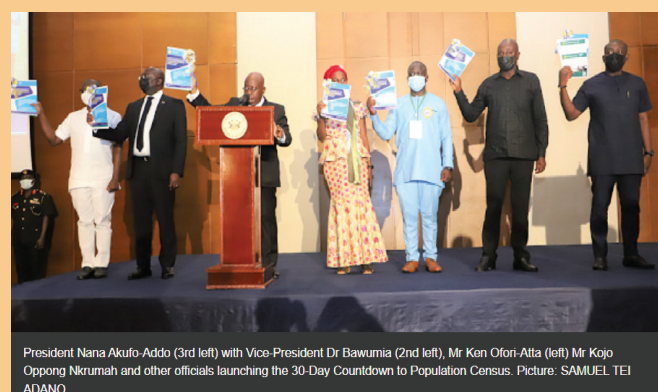
President Nana Akufo-Addo (3rd left) with Vice-President Dr Bawumia (2nd left), Mr Ken Ofor-Atta (left), Mr Kojo Oppong Nkrumah and other officials launching the 30-Day Countdown to Population Census.

The newsletter is produced by the ECA, established in 1958 as one of the UN's five regional commissions to promote the economic and social development of its 54 African member states. You can sign up to receive the newsletter here. Find out more about ECA's census work on the new Census Hub website.